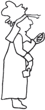
Figure 24. Gesture 13 (K764 drawing by Monika Ciura).