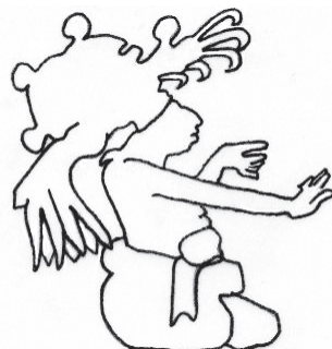
Figure 20. Gesture 10 (K1210 drawing by Monika Ciura).