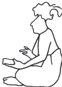
Figure 19. Gesture 9a (K512 drawing by Monika Ciura).