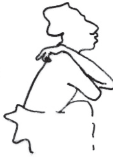
Figure 10. Gesture 6a (K512 drawing by Monika Ciura).