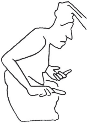
Figure 3. Gesture 3 (K1196 drawing by Monika Ciura)