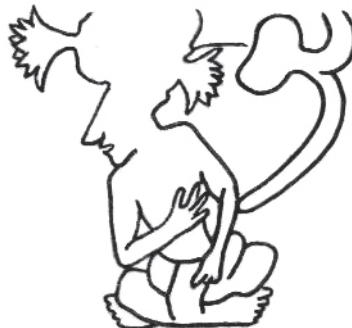
Figure 16. Gesture 7 (K558 drawing by Monika Ciura).