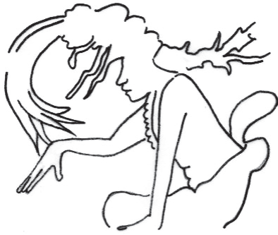
Figure 9. Gesture 5 (K1220 drawing by Monika Ciura).