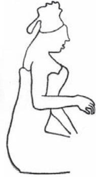
Figure 23. Gesture 12 (K2707 drawing by Monika Ciura).