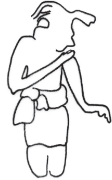
Figure 26. Gesture 15 (K1790 drawing by Monika Ciura).