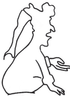
Figure 7. Gesture 4 (K1227 drawing by Monika Ciura).