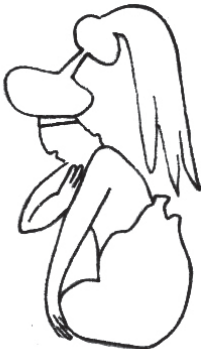
Figure 15. Gesture 6f (K1205 drawing by Monika Ciura).