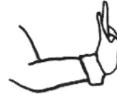
Figure 31. Gesture 20 (K2914 drawing by Monika Ciura).