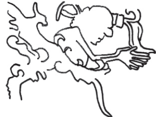
Figure 29. Gesture 18 (K6754 drawing by Monika Ciura).