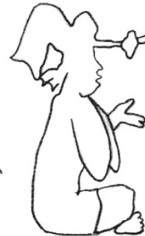
Figure 14. Gesture 6e (K1186 drawing by Monika Ciura).