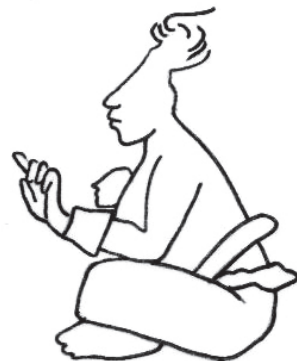
Figure 17. Gesture 8 (K1524 drawing by Monika Ciura).