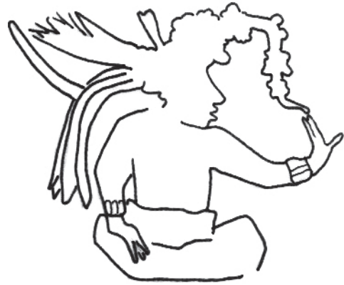
Figure 1. Gesture 2 (K 2732 drawing by Monika Ciura).

Another pose in which this gesture appears is pose 3, in which both hands are spread out on both sides of the body. This is a pose characteristic for the Maize God.