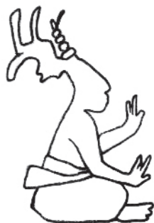
Figure 18. Gesture 9 (K512 drawing by Monika Ciura).