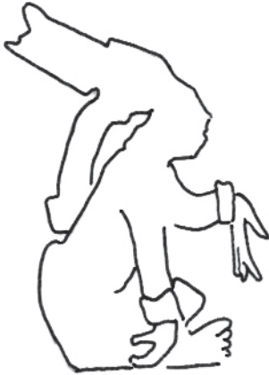
Figure 1. Gesture 1 (K 114, drawing by Monika Ciura).