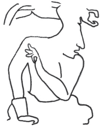
Figure 5. Gesture 3b (K868 drawing by Monika Ciura).