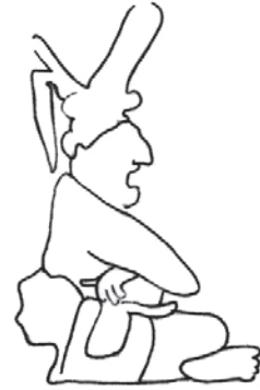
Figure 11. Gesture 6b (K625 drawing by Monika Ciura).