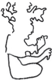
Figure 27. Gesture 16 (K1485 drawing by Monika Ciura).