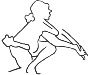
Figure 13. Gesture 6d (K593 drawing by Monika Ciura).