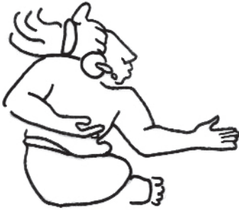
Figure 30. Gesture 19 (K4118 drawing by Monika Ciura).