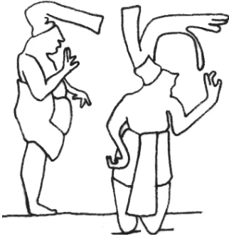
Figure 21. Gesture 11 (K751 drawing by Monika Ciura).