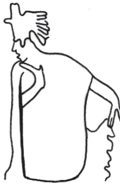
Figure 28. Gesture 17 (K2573 drawing by Monika Ciura).