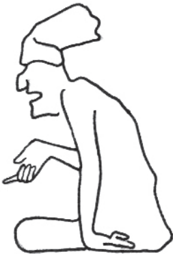
Figure 6. Gesture 3c (K1196 drawing by Monika Ciura).