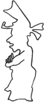
Figure 12. Gesture 6c (K532 drawing by Monika Ciura).