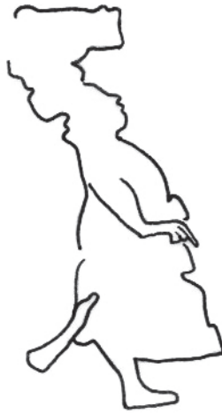
Figure 4. Gesture 3a (K796 drawing by Monika Ciura).